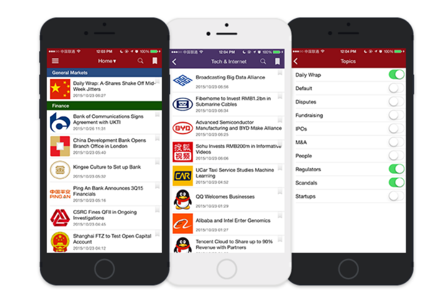
Figure 3: Red Pulse iOS app

China's markets continue to reform and liberalize through a top-down approach driven by the government and its policies. Keeping track of policies and understanding the potential effect on industries is critical to anticipate the direction of the market and investment environment. We follow major government and regulatory bodies, providing analysis on relevant policies that may have an impact on sectors and companies.